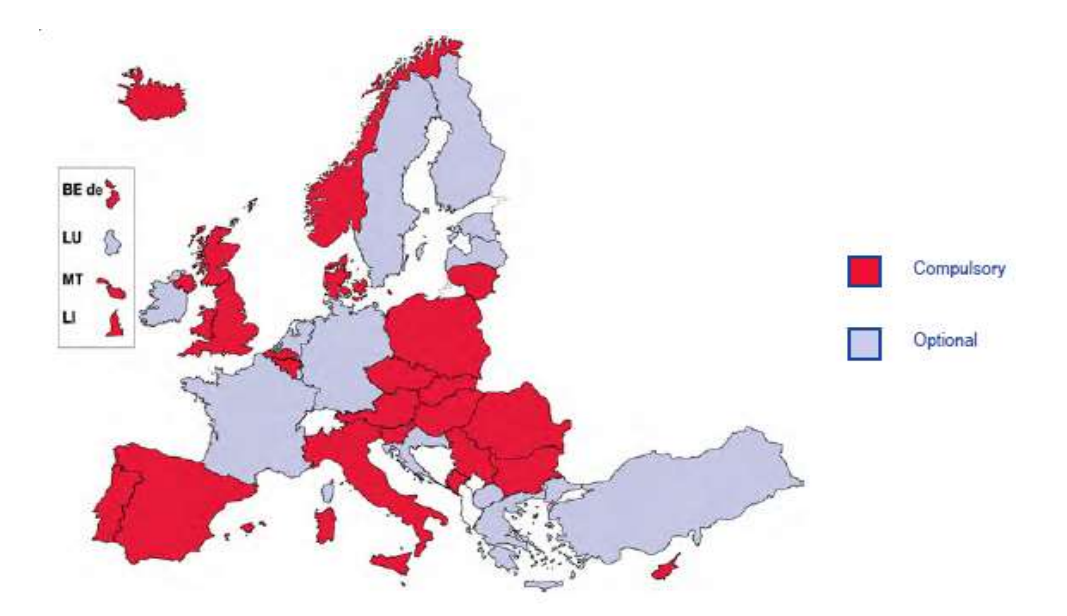
EURYDICE – TALIS 2013: Teachers' needs in professional development, as expressed by teachers in lower secondary education (ISCED 2), 2013

In Europe, there are six types of national systems in terms of the actor who defines CPD needs and plan of teacher training: individual teachers define their needs and training plan only in Luxembourg and Scotland; top-level authority for education ( national ministry of education ) (e.g. Greece); local education authorities or schools define CPD plan (10 countries: e.g. Belgium (German-speaking), Czech Republic, Germany); both the top-level education authority and the local authorities or schools define training needs (e.g., Croatia, Italy, Turkey); training needs are established by the local authorities and schools, together with individual teachers (e.g. Hungary, United Kingdom (England, Wales, and Northern Ireland), Iceland); mixed system with all players (e.g. Spain, Cyprus, Malta, Portugal). In 13 education systems in Europe, the CPD plan at school level is not compulsory.